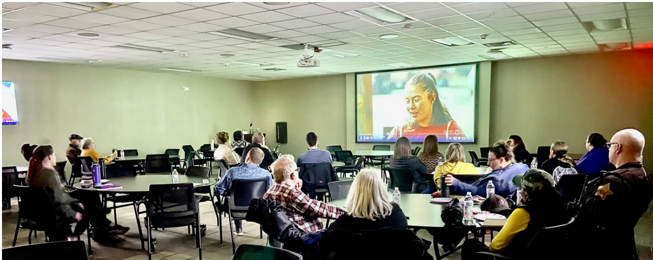
Participants in FWCS' March 5 parent education night on vaping view the PBS documentary "Nic-Sick," in which teens share their often heartbreaking struggles with nicotine addiction (See p. 2 for the link to view this excellent and poignant film).

A Quarterly Newsletter of Tobacco Free ALLEN COUNTY